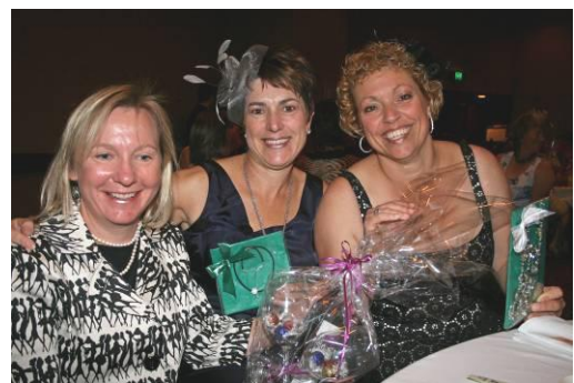
Some of the many happy raffle winners