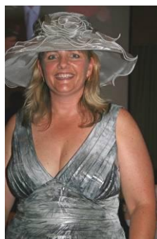
The Fashion Parade