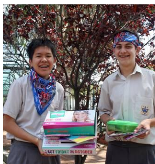
Edmund Rice Outreach members recently sold Bandannas at school. $ 564 was raised to support teenagers living with cancer.

Participating in the St Vincent de Paul Christmas Appeal is a wonderful opportunity to do this. This Appeal reminds us that on Christmas Eve every person, no matter what their age, is wishing that Christmas day will be full of good things that they hope for: presents, good food, happy family relationships, the chance to feel special and valued ... thousands of children in Western Australia wake up on Christmas morning with none of those expectations fulfilled. We can help to make one thing happen for sure on Christmas day for these children by providing a gift for the St Vincent de Paul Christmas Appeal.